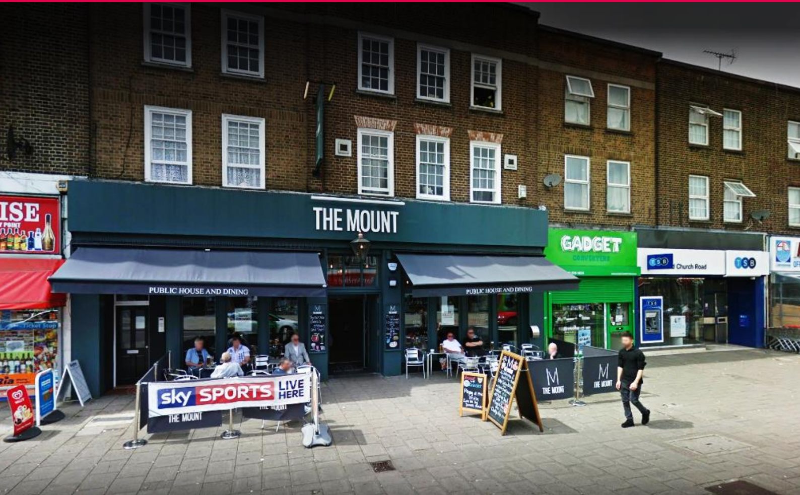
The Mount, 30-32 Old Church Road, Chingford, E4 8DD