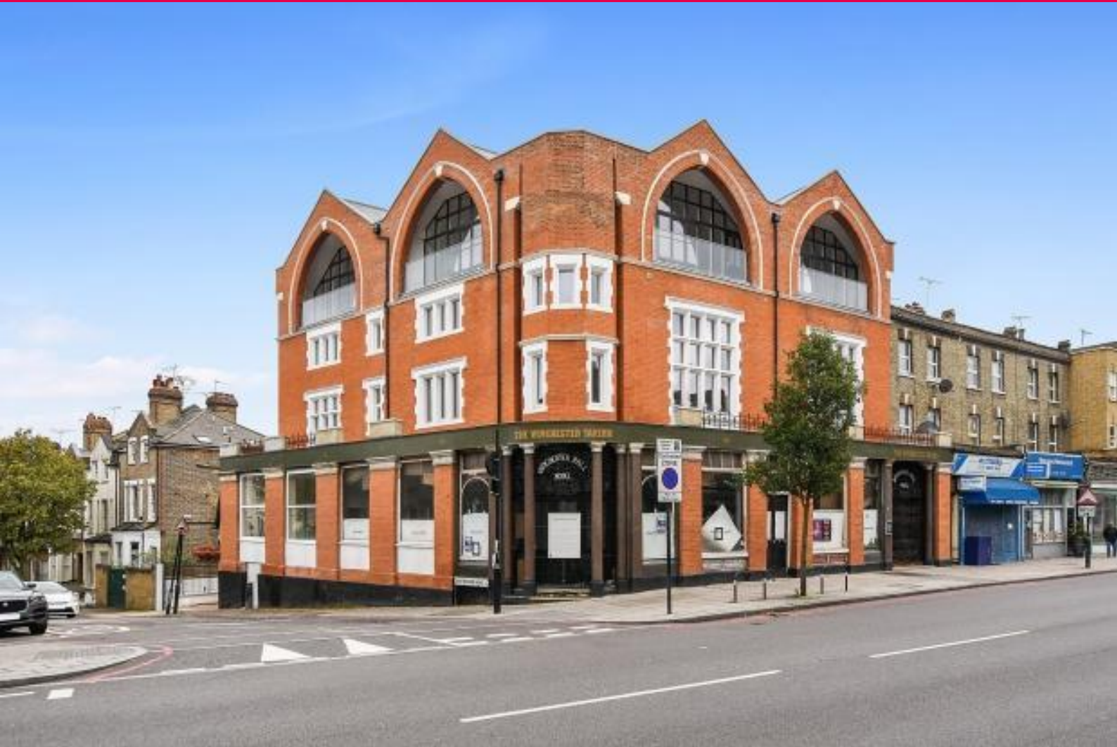
Winchester Hall Tavern, 206 Archway Road, Highgate, London, N6 5BA