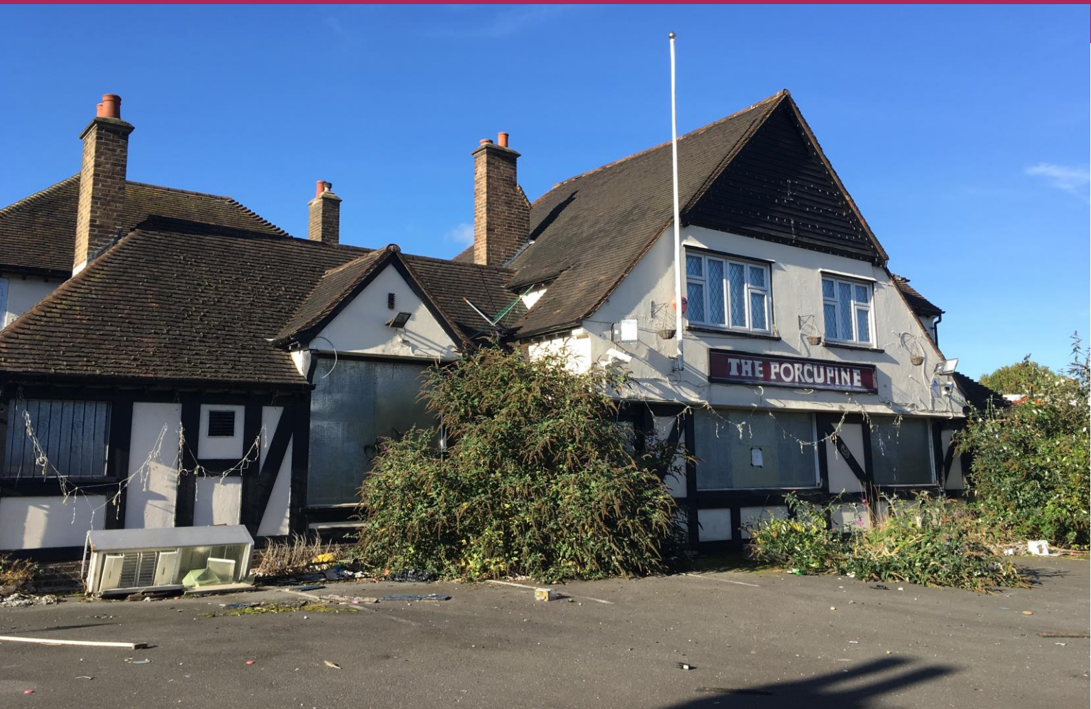
The Porcupine, 24 Mottingham Road, Mottingham, London, SE9 4QW