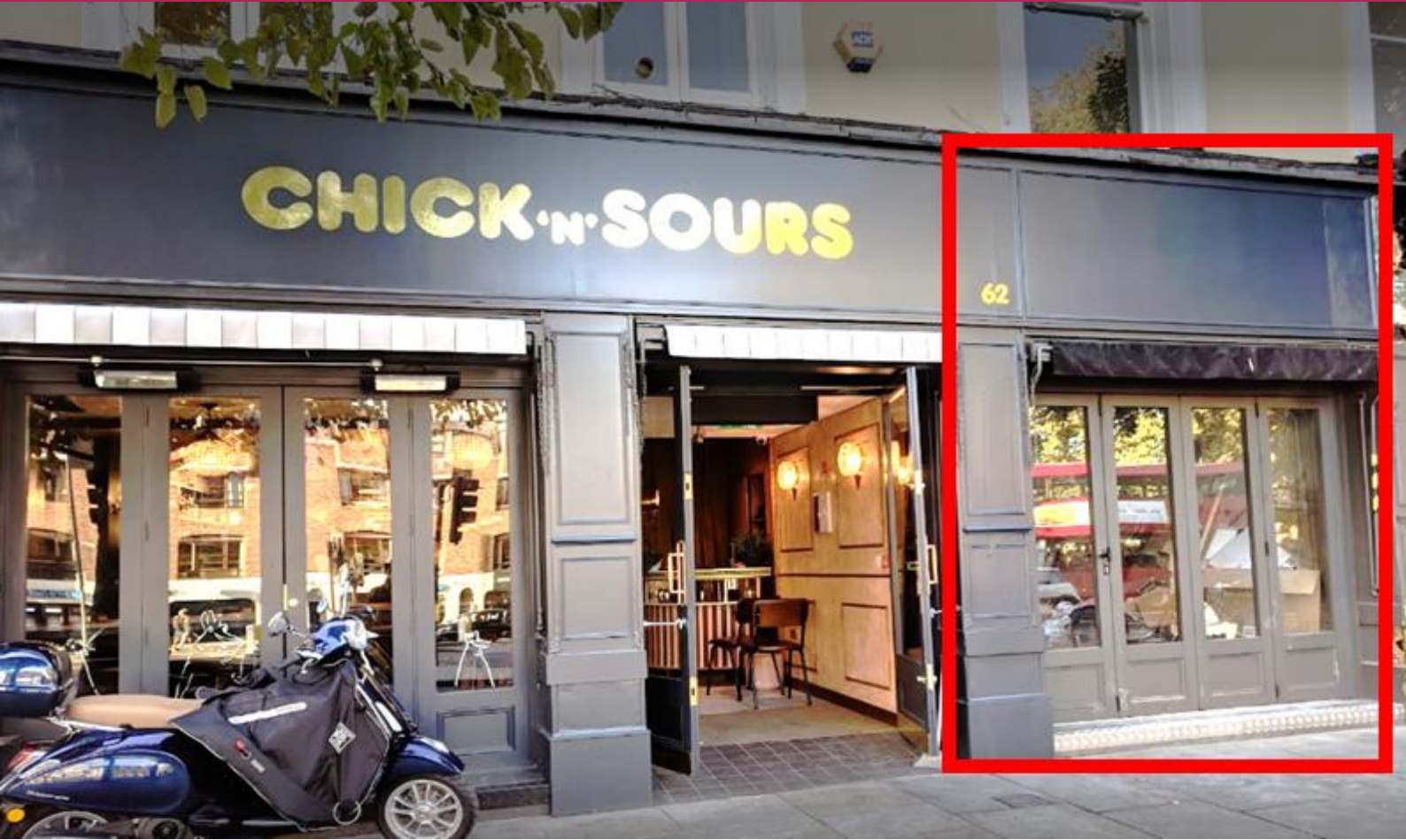
63 Upper Street, Islington, London, N1 0NY