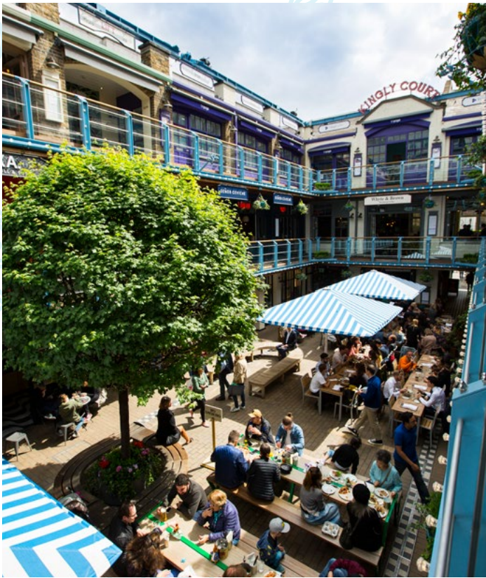
Al-fresco dining, Kingly Court

This unique food hub brings 21 of the best international concept restaurants, bars and cafés situated in a vibrant courtyard, which is open air throughout the summer months and covered in the winter.