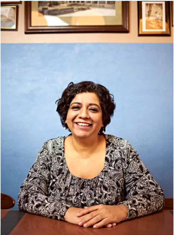
Asma Khan, Chef and Restaurateur Darjeeling Express